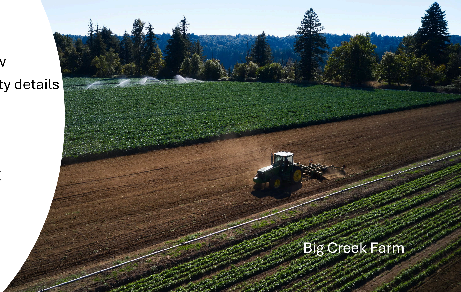
Big Creek Farm